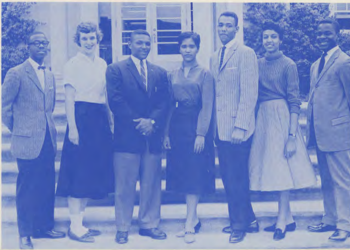
Student Council representatives and "Miss Lincoln" and her attendants