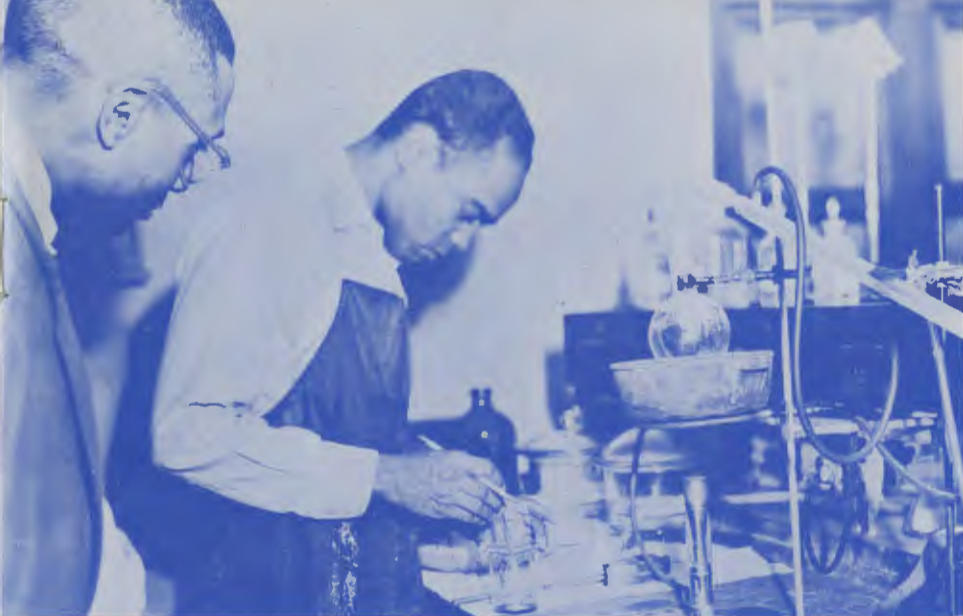
a laboratory experiment . . .