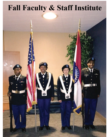
Fall Faculty & Staff Institute