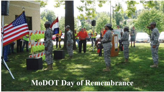
MoDOT Day of Remembrance