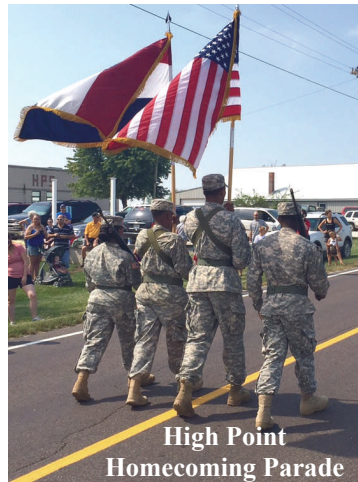
High Point Homecoming Parade