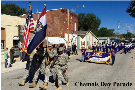
Chamois Day Parade