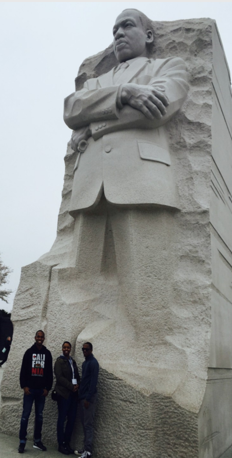
Martin Luther King, Civil Rights Activist