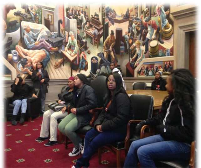
Missouri House Lounge come to life with vibrant paintings by Thomas Hart Benton. His paintings covers the entire room.