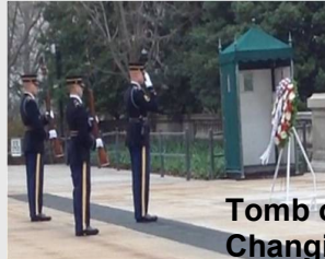
Tomb of the Unknown Soldier Changing of the Guard