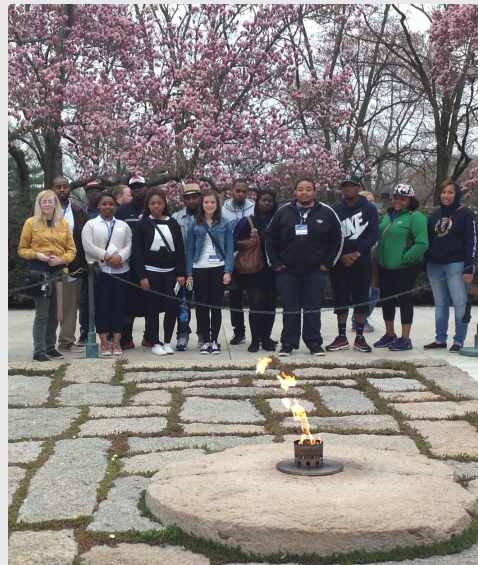
President J. F. Kennedy Gravesite