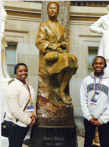
Rosa Parks, Civil Rights Activist