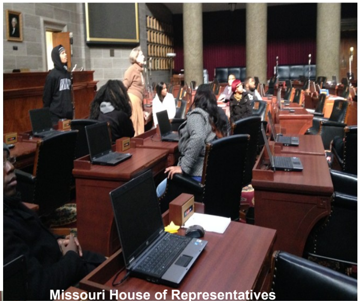
Missouri House of Representatives