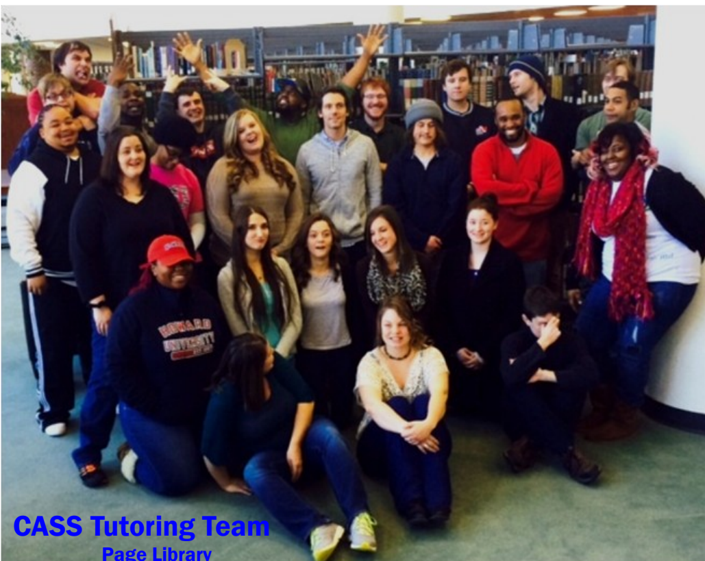
CASS Tutoring Team Page Library

6. A tutor will hold you accountable for completing work. This will help you with time management skills and will also mean that you may simply be spending more time with the material than you would otherwise.