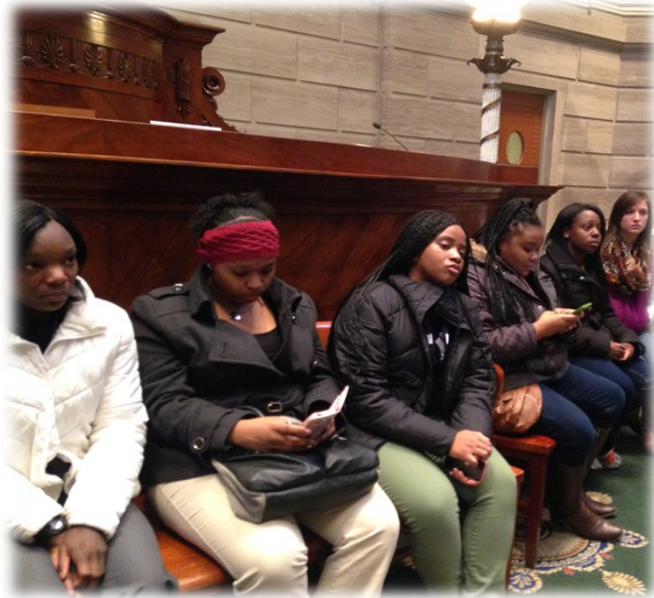
Missouri Senate Hearing Chamber